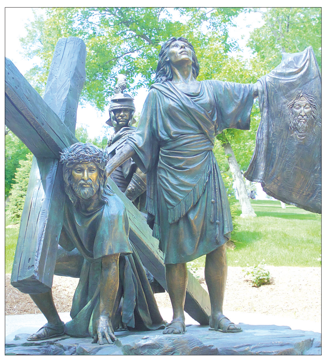
Station 6 - Veronica wipes Jesus' face (and the image of Jesus' face is indelibly etched in her cloth) - Martin Eichinger